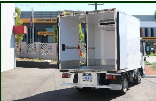
2 Pallet Refrigerated Body