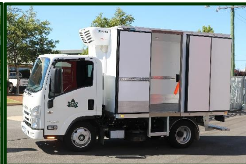
Side Access Doors