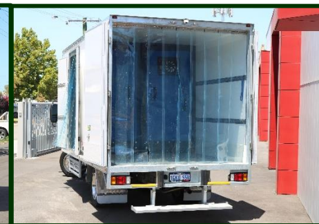
Curtains – keep the cool in whilst you take your goods out!