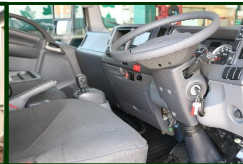
Car Type Driving Layout

"Our fleet includes vehicles with or without standby units. The interior reflects that of a car so is comfortable and familiar to use for all drivers."