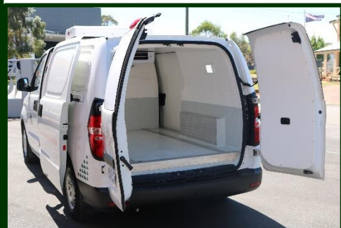
1 Pallet Refrigerated Body With Barn Doors