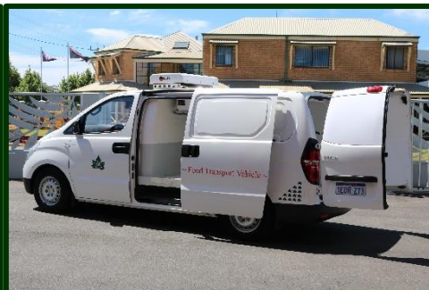
Right and Left Sliding Door Access