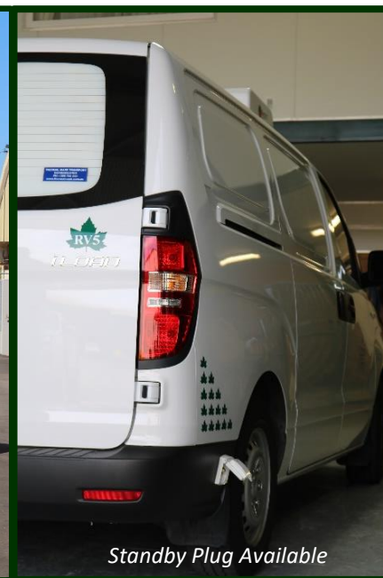
Standby Plug Available